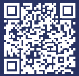
RUT230 360° VIEW